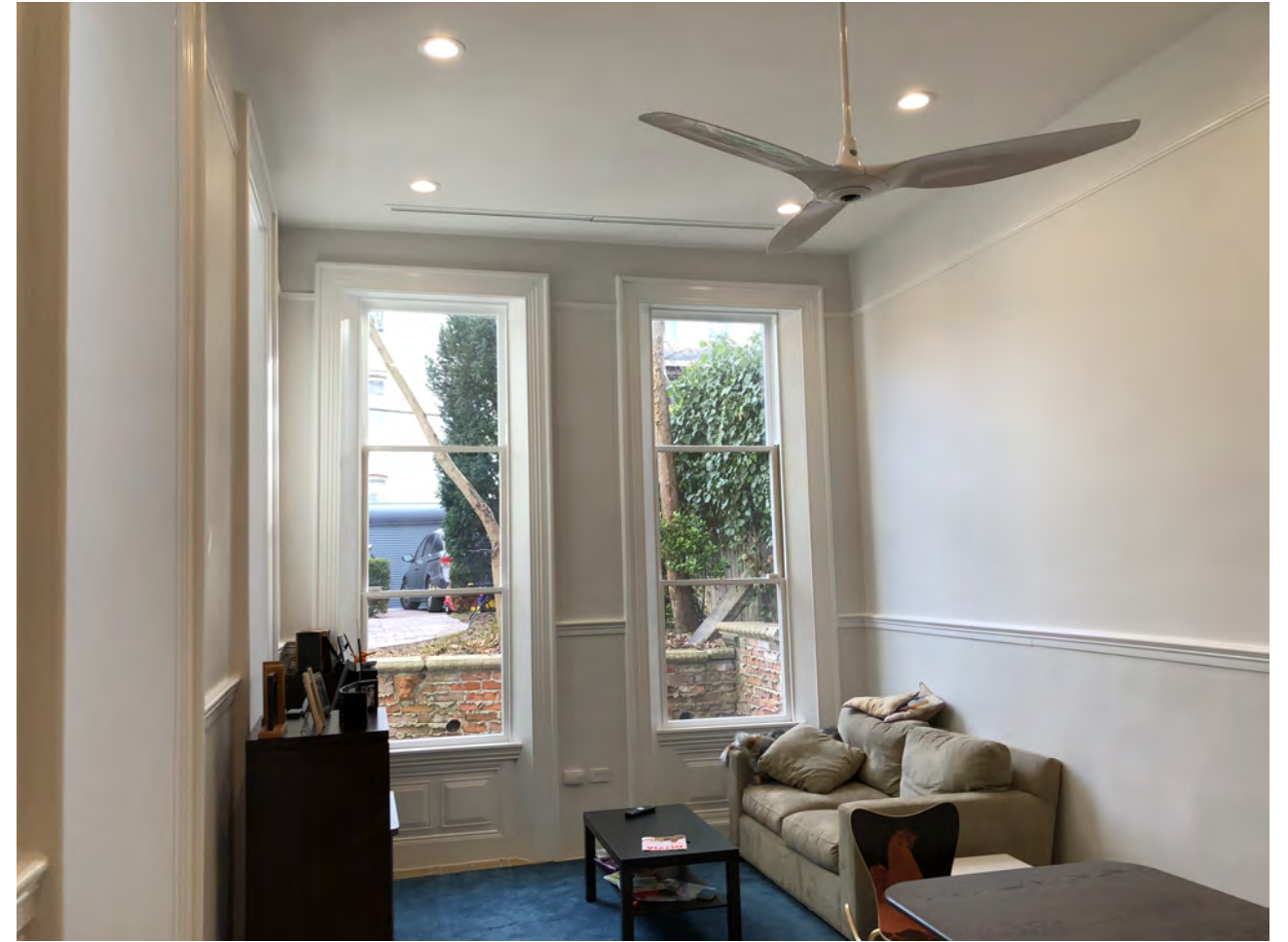
REAR ROOM @ 1st FLOOR - Looking toward rear