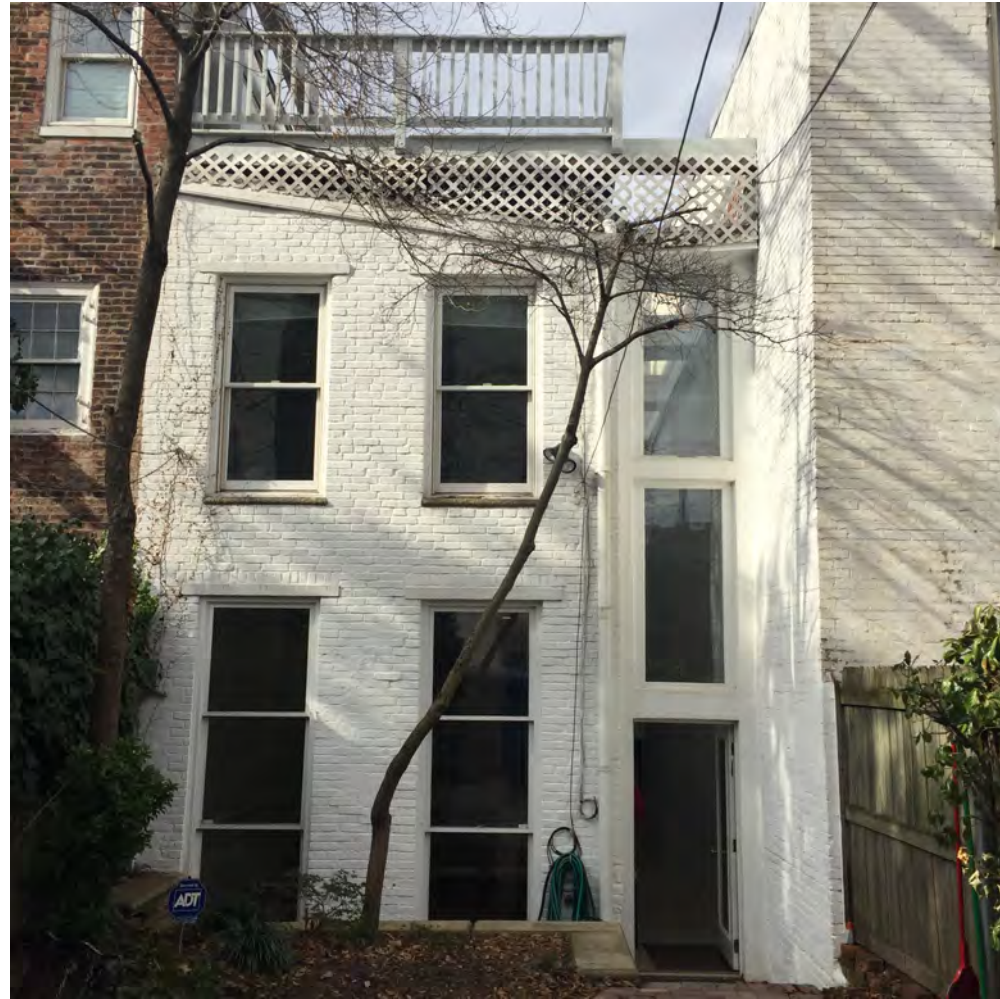
REAR FACADE (East)