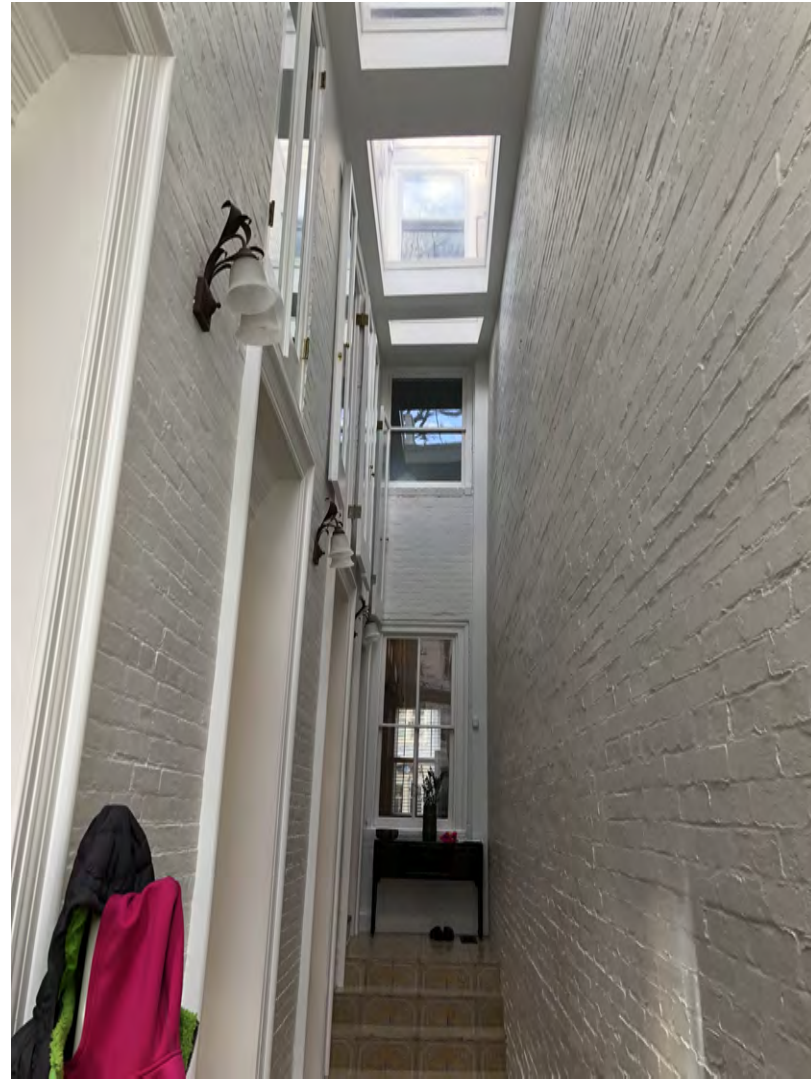
DOGLEG - Looking toward front