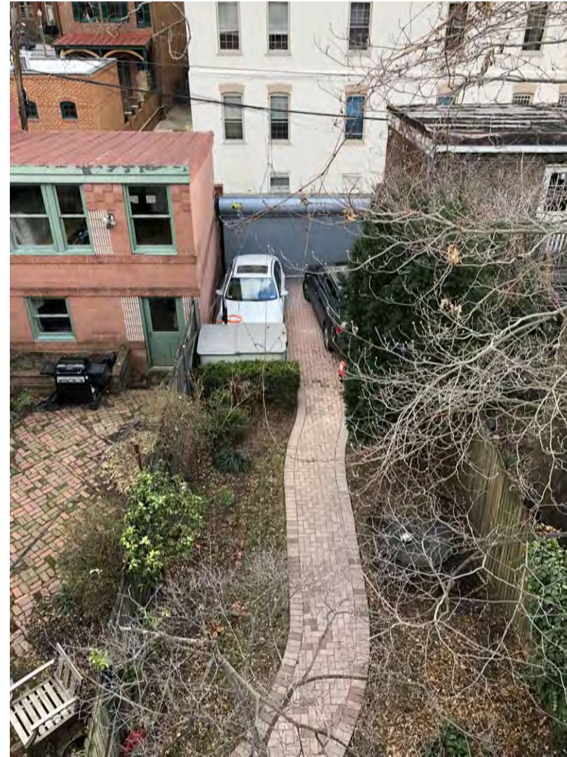
REAR YARD (West)