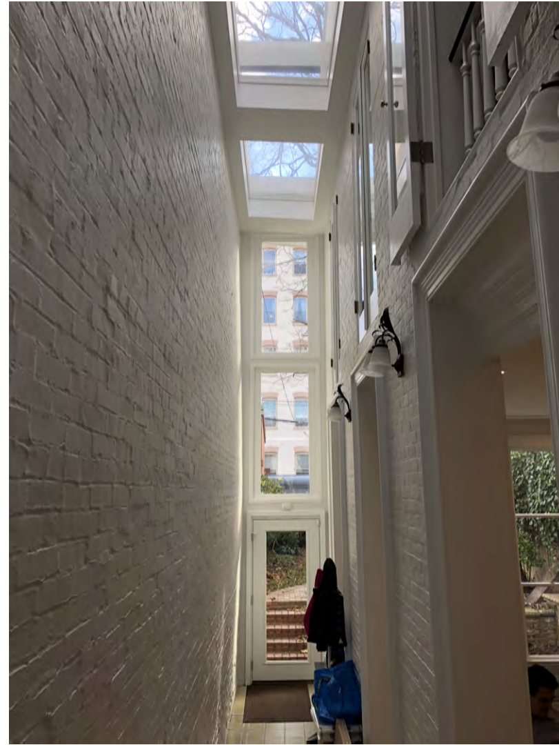
DOGLEG - Looking toward rear